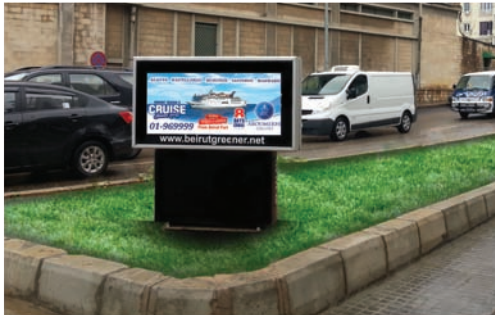
Main road 01 (Sofil toward Fassouh)