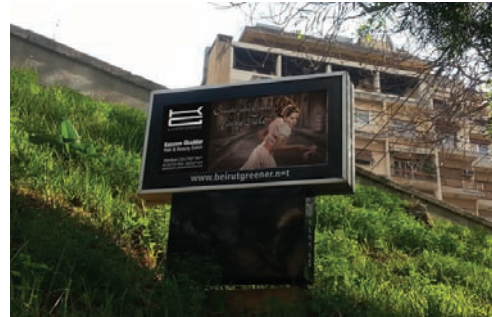
Spinneys towards Hekmeh