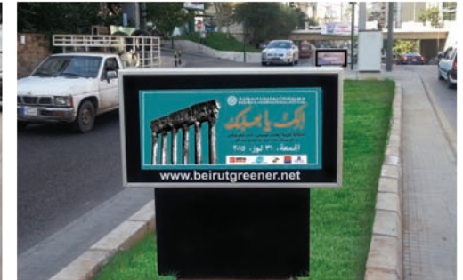
Main road 02 (Fassouh toward Sofil)