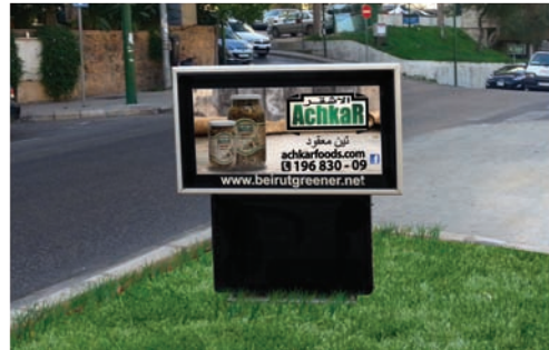
Main road 01 (Fassouh toward Sofil)