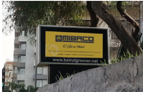
Sofil toward Fassouh